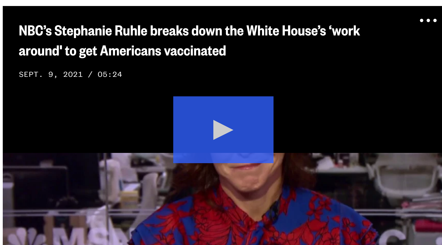
NBC's Stephanie Ruhle breaks down the White House's 'work around' to get Americans vaccinated SEPT. 9, 2021 / 05:24