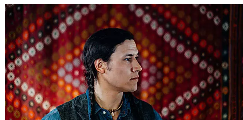
CR1 GENETICS Montana Man Discoveries He Has Oldest DNA in America