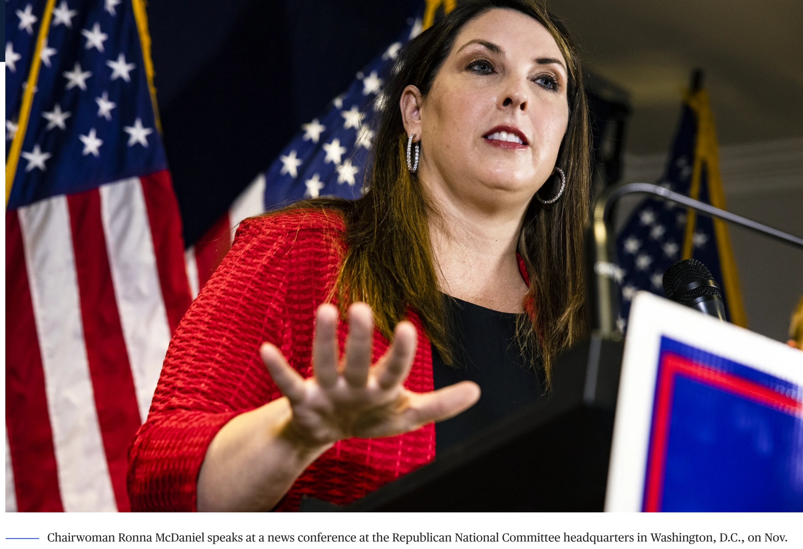
Chairwoman Ronna McDaniel speaks at a news conference at the Republican National Committee headquarters in Washington, D.C., on Nov. 9.

Chairwoman Ronna McDaniel said Biden's executive orders are "unconstitutional."